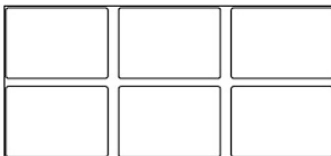
big ice-cream containers 360 x 250 mm